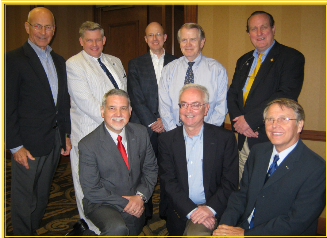
Some of the SSCI's Past Presidents. Photo taken at the June, 2011 mid-year retreat.

In closing, let us the members of the SSCI explore our creative potential as we pledge to advance knowledge, ideas and information, to mentor future generations of biomedical investigators and to develop programs that support and indeed promote young clinician scientists. Exceptionalism is within our reach, let us explore it together.