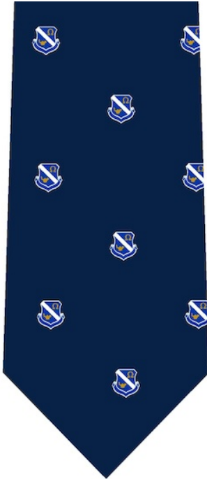
Item SSCI-001 (blue)