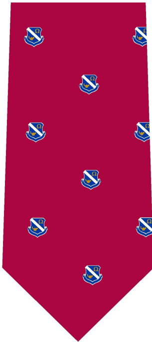
Item SSCI-002 (red)

100% silk ties in your choice of blue, gold or red $30.00